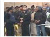
Pakistan Terror Arrests