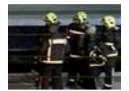
Spain Train Deaths