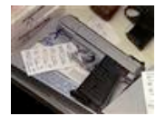
Scotus Chi Guns