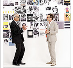
(Insert Celebrity Name Here): The Movie