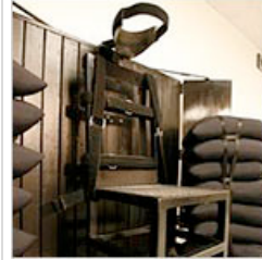
Timothy Egan: The Last Firing Squad