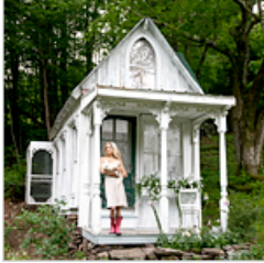
Dream of a Home in a Victorian Retreat