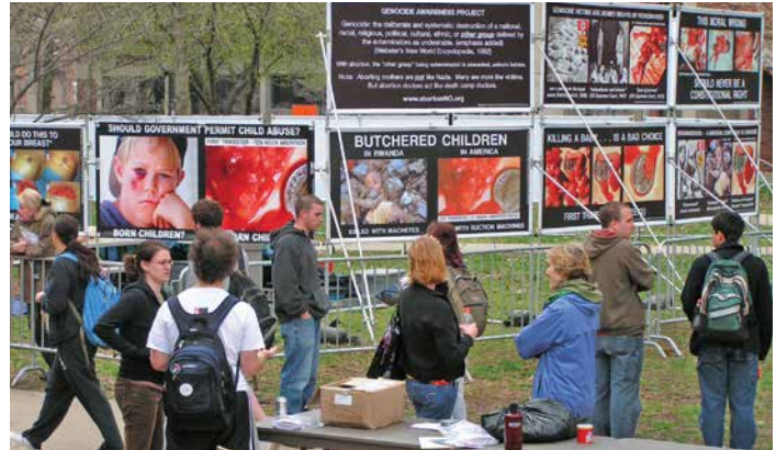
University of Louisville- Despite cloudy and rainy weather at University of Louisville GAP, 65% said GAP was effective, including 29% who said specifically that GAP changed their own minds.

It was a clear illustration of how a well-planned ... project could reach hundreds of people in a very short span of time.