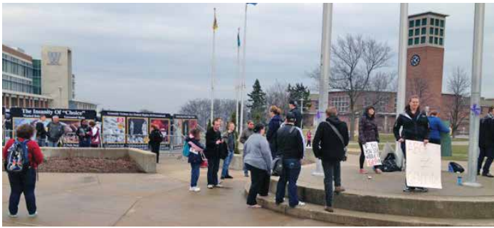
Western Michigan State GAP was held on the rainy days of April 8-9, 2013, but rain did not prevent our sturdy signs from communicating our powerful message.

Please continue your prayers and support of CBR. The babies need our deeds, not pro-life platitudes.