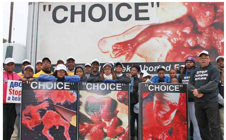
Say So marchers stand by the CBR truck during a stop along the march route.