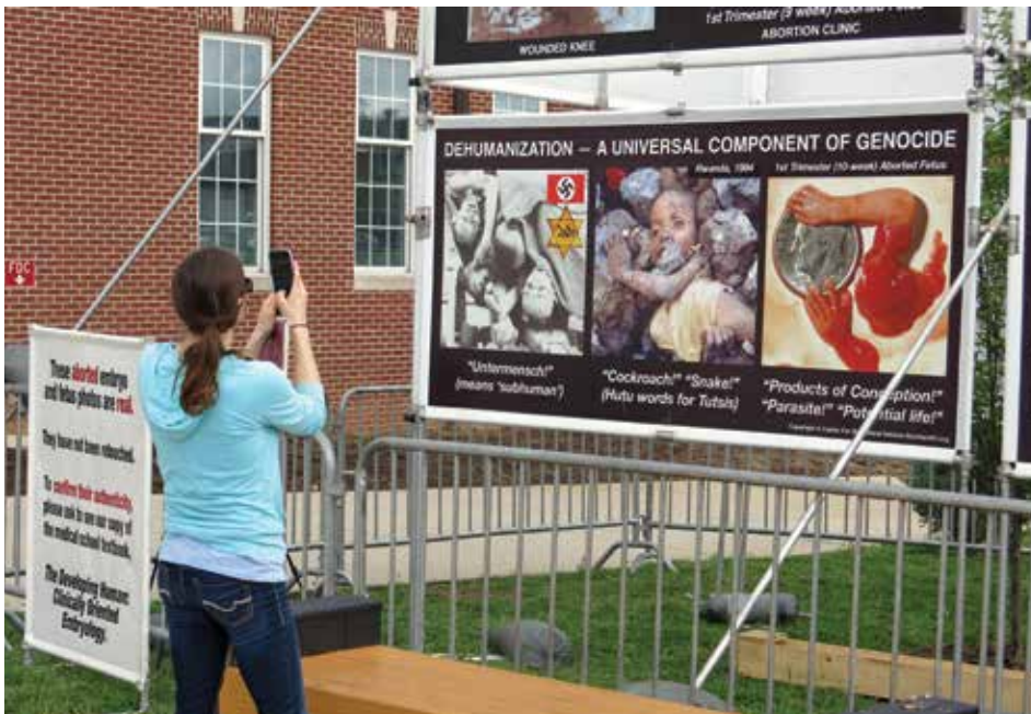
A Tennessee Tech student takes a photo of a GAP sign, a common occurrence that helps spread our message as they share their pictures with their peers and on social media.