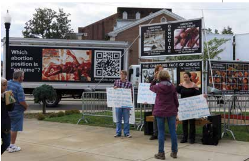
A CBR Reproductive "Choice" Campaign truck drives by the Tennessee Tech GAP display while protesters vainly attempt to dissuade people from seeing our message that abortion is genocide.