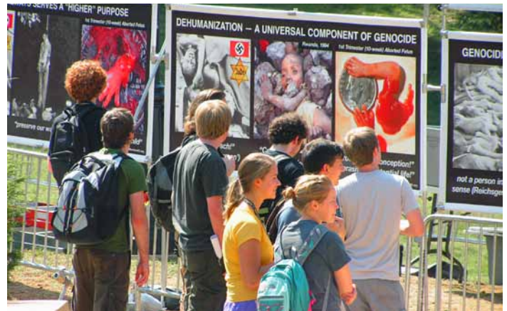
UTC students are captivated (September 12-13, 2011) by pictures that reveal the truth about abortion. They are forced to deal with the facts that the preborn child is really a baby, even in the first trimester, and abortion is a horrifying act of violence.

The photos indeed get students talking about abortion and many will become pro-life as a result of GAP.