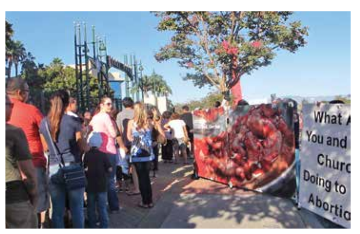
A team of CBR staff and volunteers held abortion photo signs and text signs at the Harvest Crusade in Anaheim, California on August 15-17. Over 116,000 people saw the signs -- now what will the Christians who attended do with this knowledge?

replied, "Oh, I just have to go to the bathroom." These young women added lying to their other grievous behavior.