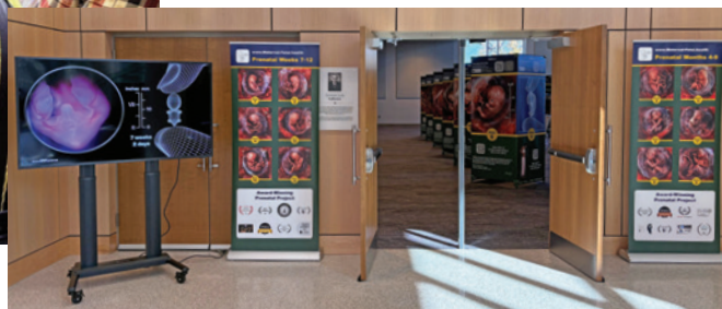
Below: The prenatal science project was at Asbury University. We can adapt our exhibits to fit numerous venues.