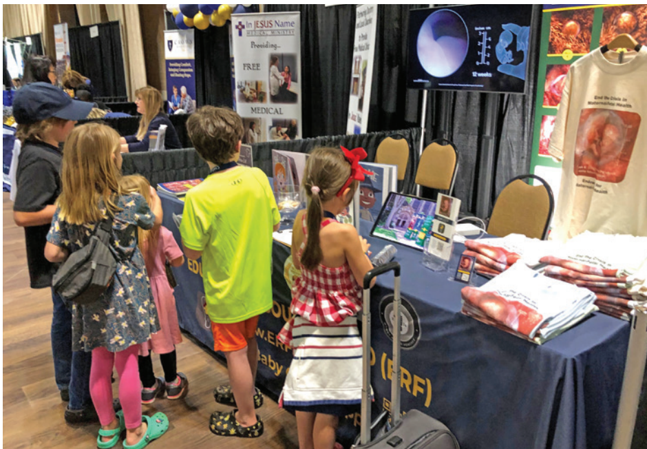
Children of physicians attending the 2025 Christian Medical & Dental Association (CMDA) Convention were excited to see videos and photos of preborn babies.

College student looking at prenatal science exhibit in Washington, D.C.