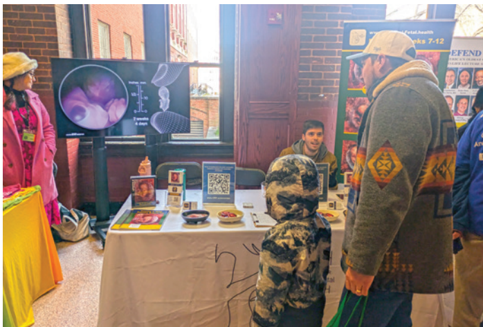
A father and son reflect on the beautiful photos and videos of preborn babies at our exhibit booth at the January 24 Cardinal O'Connor Conference in Washington, D.C. Attendees, and our staff members, braved a blizzard to attend.